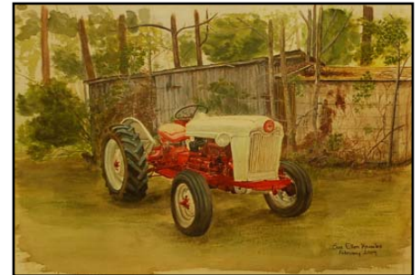
Sue Ellen Knowles, Tractor