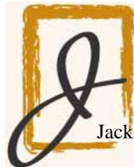
Jack Richeson & Co.