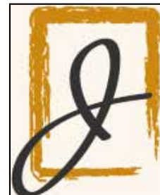
Jack Richeson & Co.