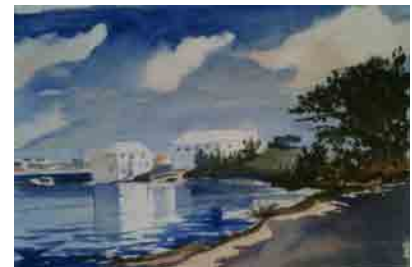
A beautiful sample from member Susan Allen, is just one of many beautiful results from McFadden's inspiring workshop.