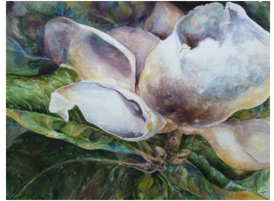
2nd Achievement Award Cassie Tucker "Misunderstood"