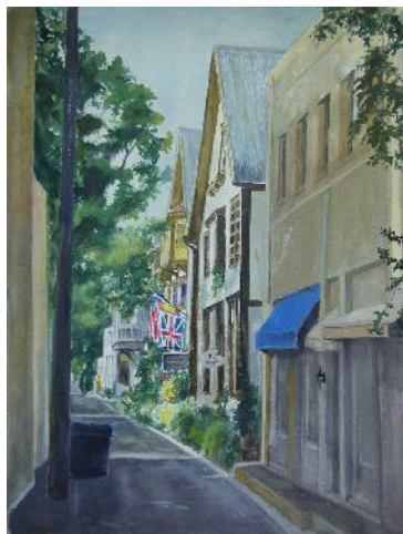
Honorable Mention Linda Menke "Morning on Avila Street"