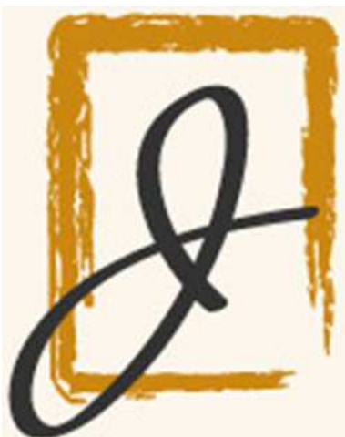
Jack Richeson & Co