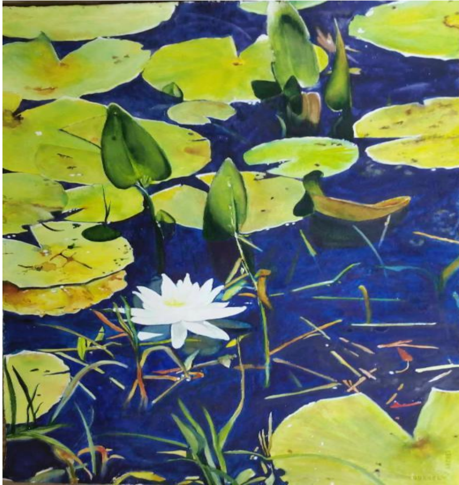
Morning Star - Susan Allen

The annual membership exhibition opens September 5 with a reception from 6:00 - 7:30 PM. The exhibition runs from September 5 through November 3, 2014 at the Hall Gallery at City Hall of Tallahassee, 300 South Adams St., Tallahassee, FL.